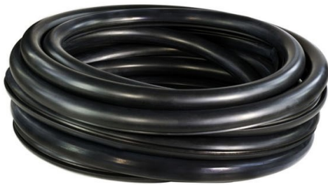
36ft Long Flexi Track

Please inspect the contents of your shipped package to ensure you have received all that is pictured and listed below.